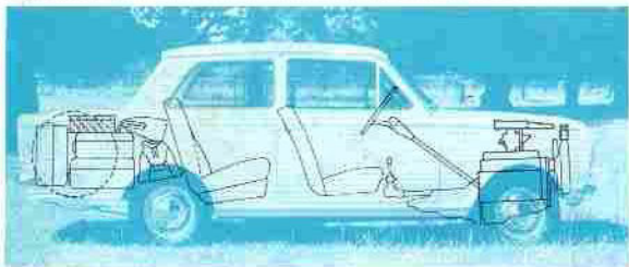
Stretching room for four big people, and space for all their luggage

* These colour schemes only for the standard Viva. Safari Beige Rayon is optionally available for both models as an alternative to Vynide.