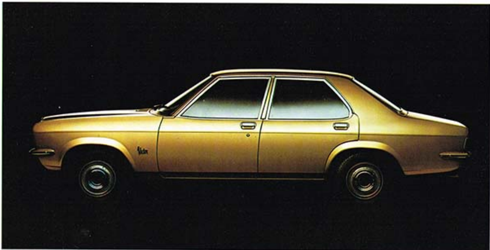
Victor 2300 Saloon.