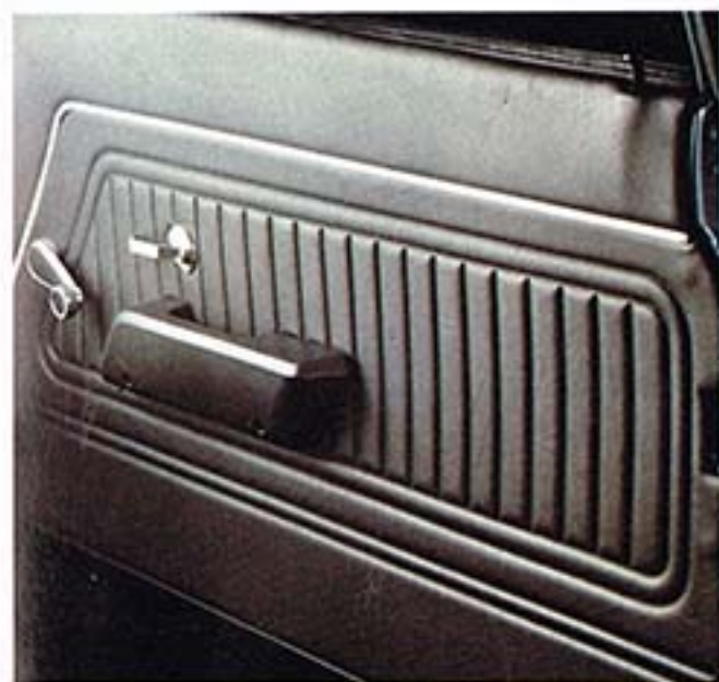
Door trim is fully padded and colour-keyed to the seats. Anti-burst locks are fitted and interior handles and window winders are safety designed.