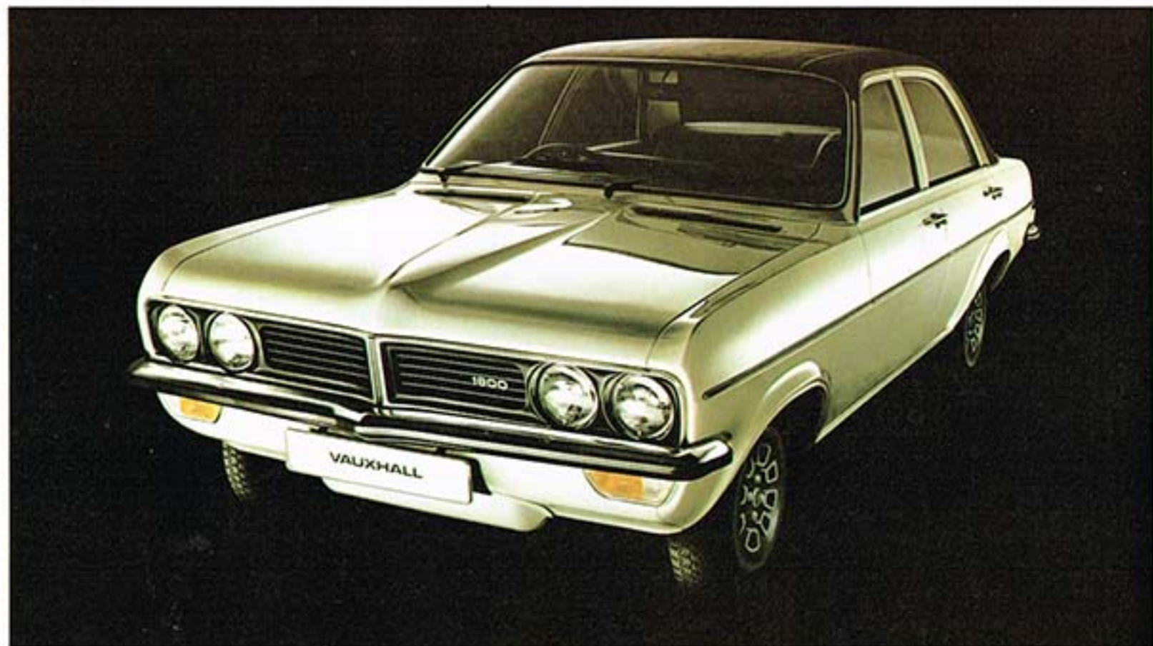
Magnum 1800 4-door Saloon.

The kind of luxury car that so many people have always wanted but so few have been able to afford—until now.