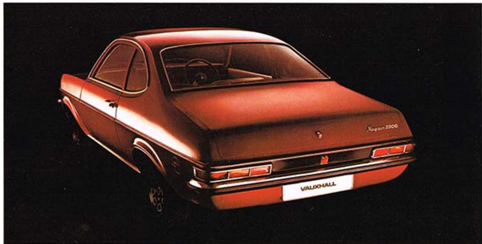
Magnum 2300 Coupé