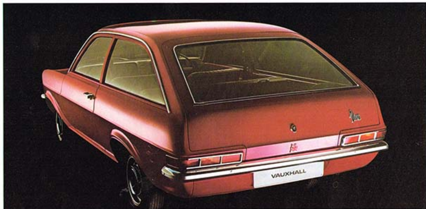
Viva SL Estate.

It's also the opposite of everything that's