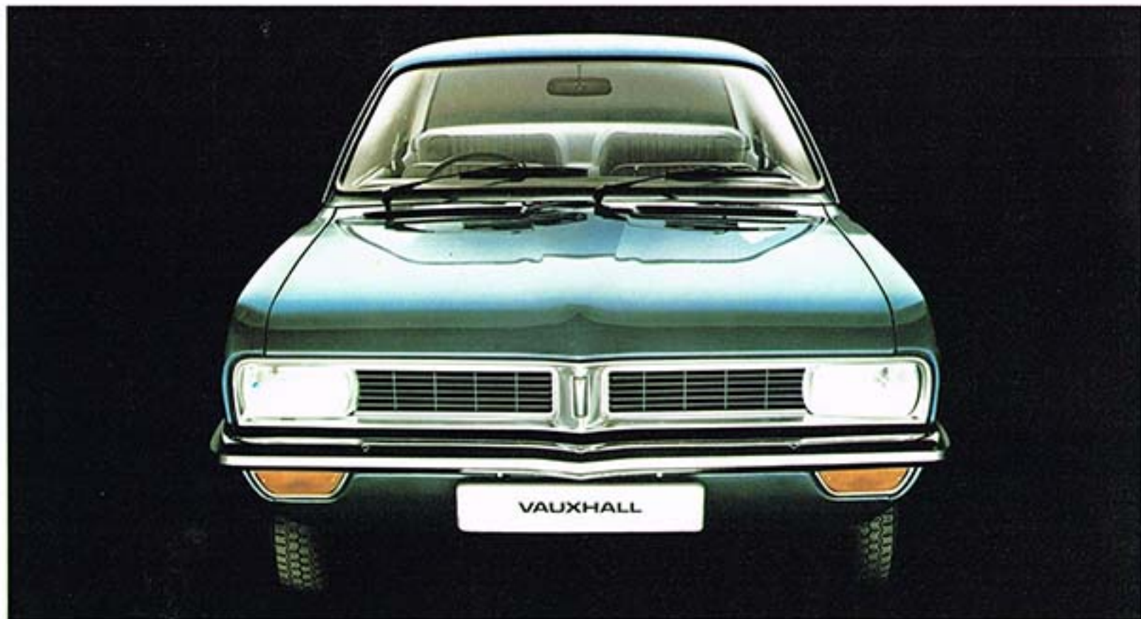
Viva de luxe.

Vauxhall's beautiful example of outstanding value for money.