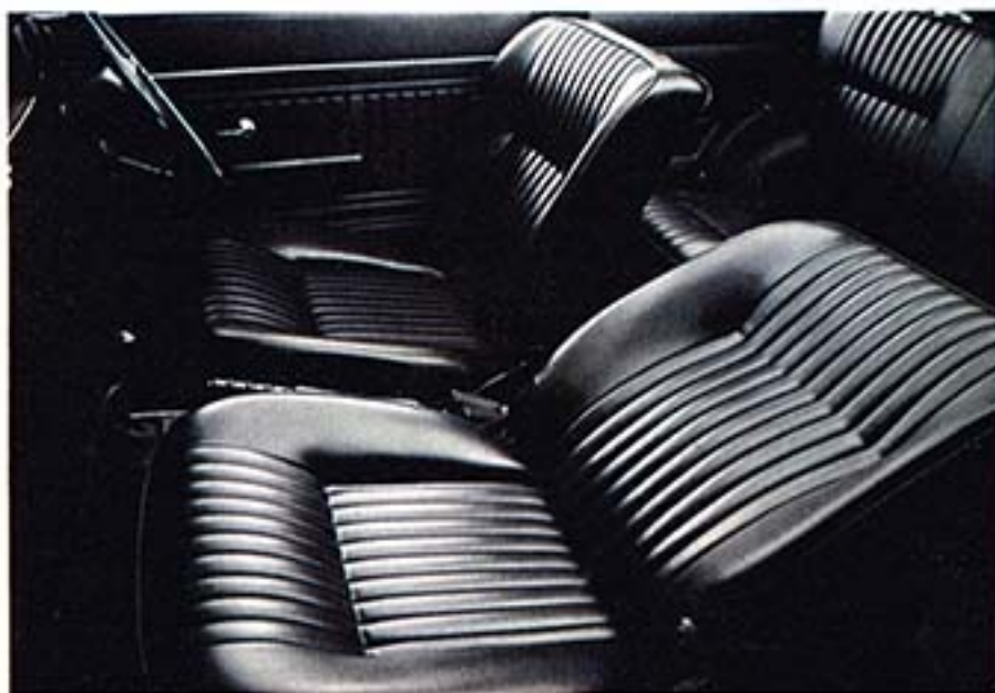
Comfortable seating for four adults. Front seats recline and all seats are upholstered in Ambra on SL models (Vynide on other models).

Please turn to pages 14, 15 and 16 for complete details of standard and optional equipment available in Viva saloons and estates.