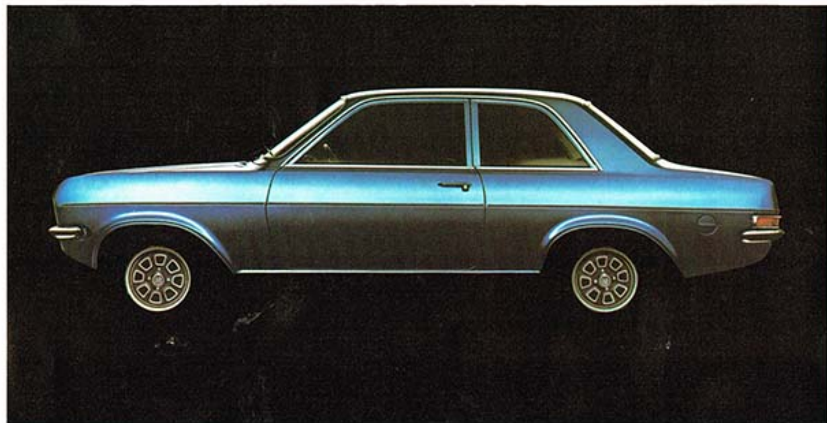
Magnum 2300 2-door Saloon.

There are four Magnum body styles to choose from—2 and 4-door Saloons (seen here), a 3-door fast back Estate and a Coupé (both