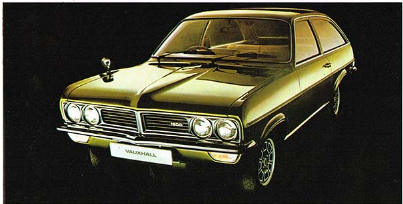
Magnum 1800 Estate

The shape of the Magnum Coupé is the promise of its performance. Smooth wind-cheating lines provide restful high-speed cruising.