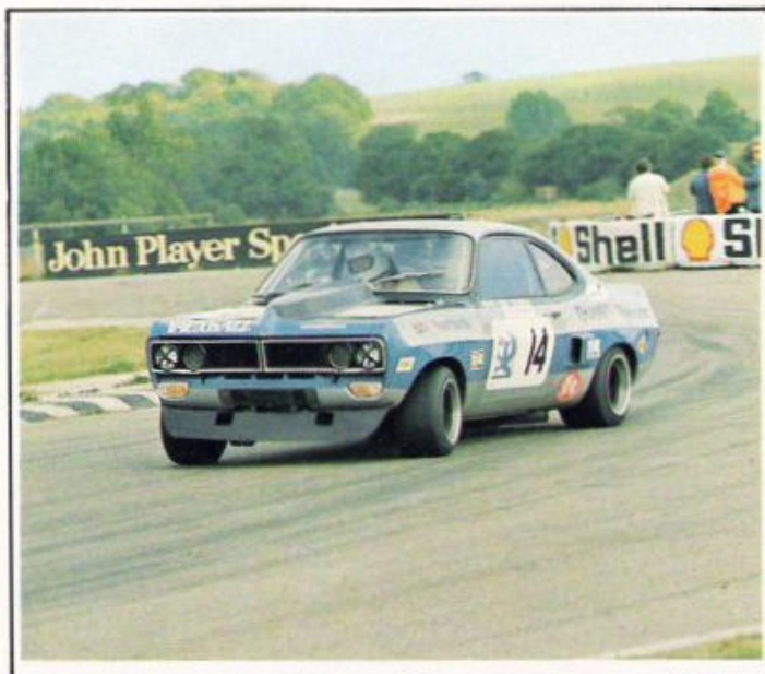
Dealer Team Vauxhall Racing Firenza