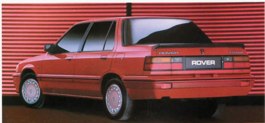
Rover 216 Vitesse

five-speed gearbox as standard. Among the numerous refinements are an electronic stereo radio/stereo cassette player with four speakers, a screened glass sunroof, and bronzetinted glass. Or you can choose the