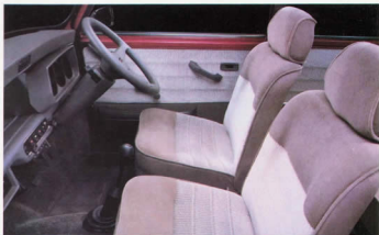
Below: Mini Mayfair. Right: Mini Mayfair interior. Main picture page 33: Mini City.

Stealing that last parking slot. And grabbing all the looks. Minis have more fun!