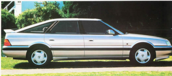
Top: Rover 820Si. Centre: Rover Vitesse with optional rich leather seat facings and automatic transmission. Main picture: Rover Vitesse.