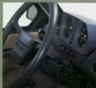
New programmed wash/wipe system