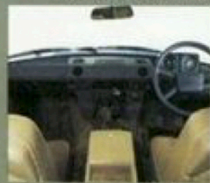
Enhanced interior trim

Two new solid colours, Shetland Beige and Venetian Red have been introduced across the range, and there is the choice of two metallic colours available through the luxury pack option on the new four door variant.