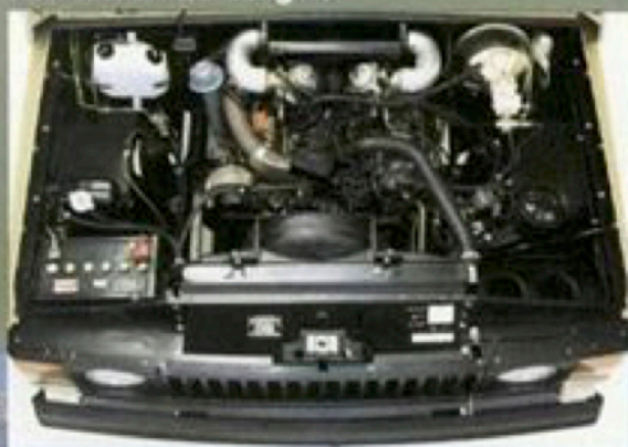
New fuel efficient engine

compared to the previous model. There's also a much quieter gearbox. Made possible by modifications to the gear tooth design in the transfer box. An improvement which follows on a recently introduced reduction in gate width to create a smoother change.