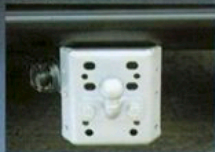
Towing equipment Various towing options available including standard 50mm ball and seven pin electrical socket.