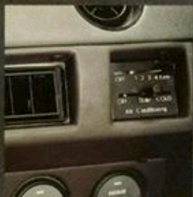
In-dash air conditioning A powerful system with all outlets and controls fascia mounted. Operates independently of heater so that de-humidified air to reduce condensation can be circulated whilst maintaining any desired interior temperature. Four blower speeds and four outlets.