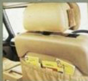
New map pockets