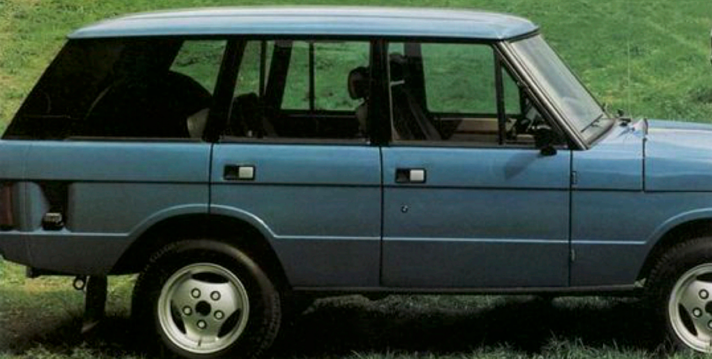
The new Range Rover 4 door

Add to this alloy wheels, special metallic paintwork, rosewood veneer door cappings and deep pile carpeted loadspace which are available through a 4 door luxury pack