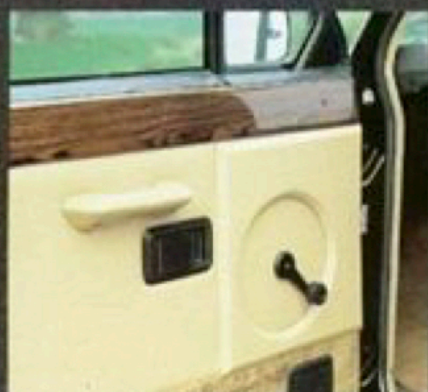
New Luxury pack option Exclusive to 4 door variant and comprising alloy wheels, blue or silver metallic paintwork, polished rosewood veneer door cappings and fully carpeted loadspace area.