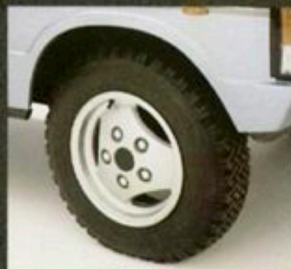
New alloy wheel option Exclusive three spoke design. Size 700 x 16 to take standard Range Rover tyres.

Your dealer can provide full details of specification and availability on these and all other options plus Unipart approved accessories.