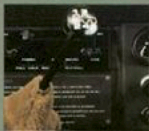
New quieter gearbox

The new Range Rovers represent evolution rather than revolution. They retain the immensely strong box section steel chassis. The high proportion of corrosion resistant aluminium bodywork. The highly respected four wheel drive system. The self levelling coil suspension.