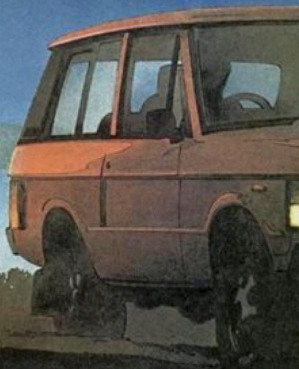
Petrol tank guard For extreme off-road conditions.